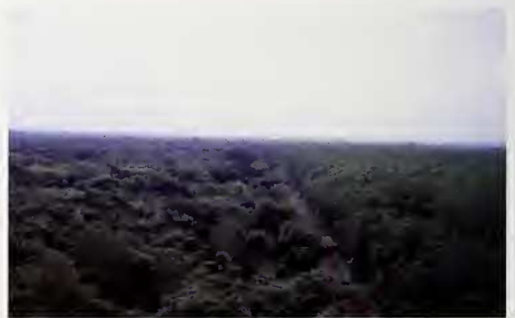
Fig. 2. Primary forest of Forêt de Lama (Noyeau central) (left) with bordering teak plantations (right)

til 1946, large areas of natural forest were already destroyed, and only 11.000 ha remained. Since the 1960ies reforestations are taking place which favoured, however, mainly teak plantations. The natural vegetation has been protected only from 1988 onwards (Emrich et al. 1999). Mean annual precipitation is 1100 mm with two peaks (big and small rainy seasons) in March to June and September to October respectively. The annual mean temperature lies between 25–29°C. The eastern part of the Lama depression is crossed – in north-south direction – by the Ouémé River valley. Close to Lama Forest, there are only few smaller creeks. During the rainy seasons, however, large parts of the area are changed into overflowed marshlands. Due to these repeated inondations and stagnant waters, there are only six dominant tree species in Lama Forest, viz. Dialium guineense , Diospyros mespiliiformis , Albizia zygia , Azelia africana , Khaja senegalensis , and Anogeissus leiocarpus . The Noyeau Central consists mainly of a mixture of relicts of a semideciduous forest which floristically approaches the “Forêt de Samba”